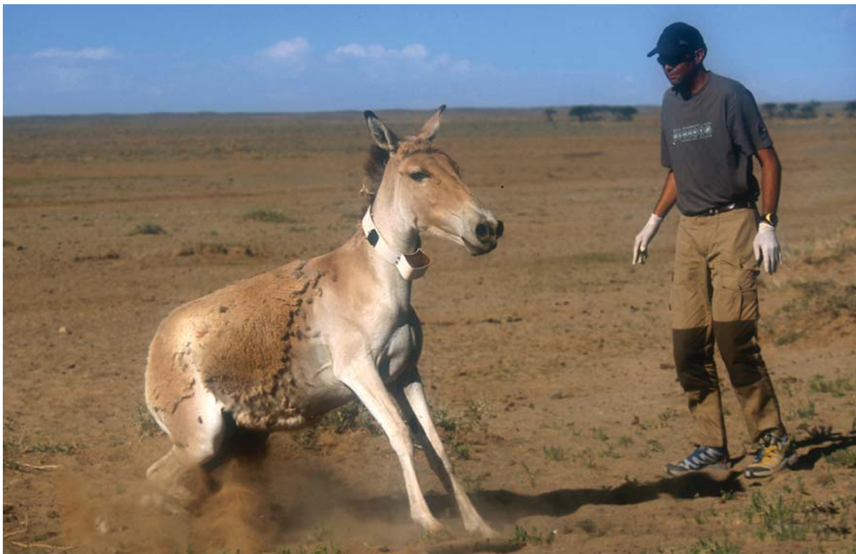
Figure 4. GPS-Argos collared khulan, standing and alert approximately two minutes after the IV administration of the opioid antagonist-agonist diprenorphine (M5050).

Human exposure to capture drugs. Using potent capture drugs bears the inherent risk of human injury. Though prevention is the mainstay in avoiding capture drug related accidents it is important to establish a protocol to deal with eventual problems. Accidental capture drug injection is always to be considered an emergency that will require calm, prompt and organized action (Walzer & Fahlman, 2006). Be aware that the legal implications of administrating medical treatment to