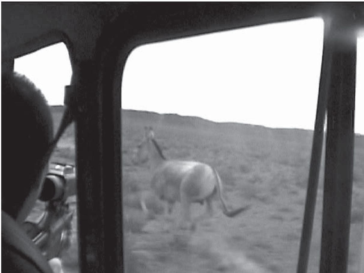
Figure 3. A khulan is chased until the jeep is able to approach within approximately 10-15 meters on a parallel track. It is then easily darted in the rump musculature using standard pressure settings.

Once an animal is identified, it is chased till the jeep is able to approach within approximately 10-15 meters on a parallel track (see Figure 3). It is then easily darted in the rump musculature using standard pressure settings. It is essential to define a chase cut off time before the procedure is started. Our experience has shown that a cut off time of 15 minutes is adequate. To date we have captured 5 animals with this very time-efficient method. The shortest chase time was 2 minutes and the longest 13 minutes. In all cases induction was extremely rapid and smooth (4-8 minutes) and body temperature was below 400 C. A severe limitation to this method is that one is only able to capture males or juveniles without foals. A chase of a female with a foal would result in (permanent) separation of the young from the mare and is therefore unacceptable.