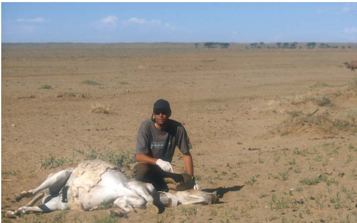
Figure 2. Once an equid has become recumbent it is essential to fix the head to prevent attempts at rising. This is best accomplished by placing weight on the maxilla.

Due to the general lack of cover in the Gobi area Przewalski's horses are extremely difficult to approach in the field. During the past years we have employed various methods to get within shooting range such as approaching on a motorcycle and horseback or waiting at water points. Using the protocol described above we have been able to successfully anaesthetize 12 horses in the