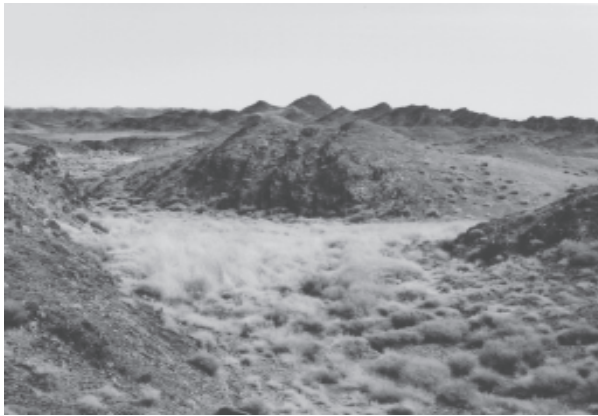
Fig. 6. Tsagaan Bogd mountain

communis , a large shrub, occurs in every oasis and is important for shelter during the hot summer and the bears eat other smaller plants associated with this species. Gobi Bear feeds on a variety of invertebrates which inhabit this plant community. The main summer diet of the Gobi Bear is the fruit of Nitraria roborovskii but this is a scarce species in the oases. Planting of this species might be beneficial as part of a Gobi Bear management programme.