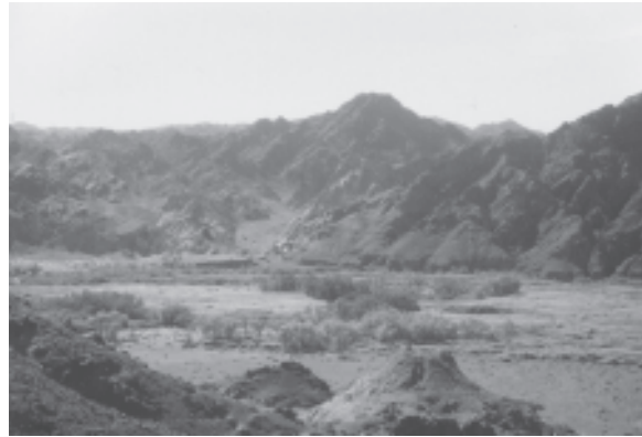
Fig. 2. Typical bear habitat in Shar Khuls

An adult male Gobi Bear in good well-fed condition was found near a food supplementation site on 29 March 2004 in Khushoot oasis area (Fig. 2). There are several sites where rangers from Great Gobi 'A' feed bears with prepared food made from vegetation (Fig. 3). The researchers took a photo (Fig. 4) and observed the individual for about 20 minutes after which they measured the footprints, the hind foot print size was 20:13cm (length:width). Length is measured from the heel to the front without the claws. Width is measured at the widest point. This individual was not seen again. The team recorded 8 footprints in five different oasis areas (Table 1).