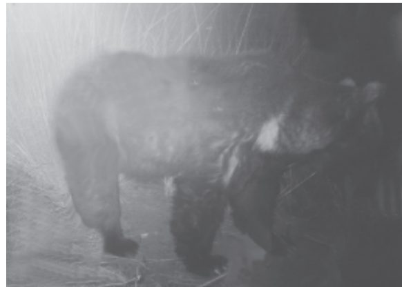
Fig. 8. Bear photographed in Mukhar Zadgai oasis

The bear seen in Fig. 8 was photographed in Mukhar Zadgai oasis using an automatically triggered camera.