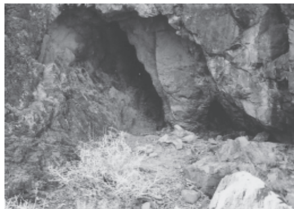
Fig 10. Cave den