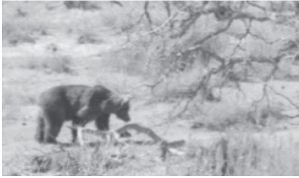
Fig. 4. Bear photographed in Shar Khuls

One footprint was found in Khushoot oasis area that was different from the photographed male (Fig. 5). Based on the size and frequency of the footprints, we assumed that the adult male bear occupies this area and that the other male was just passing through. We found only footprints, fresh faeces and urine in the other oasis areas.