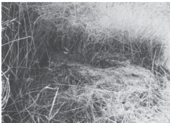
Fig 9. Old den found amongst Phragmites grass