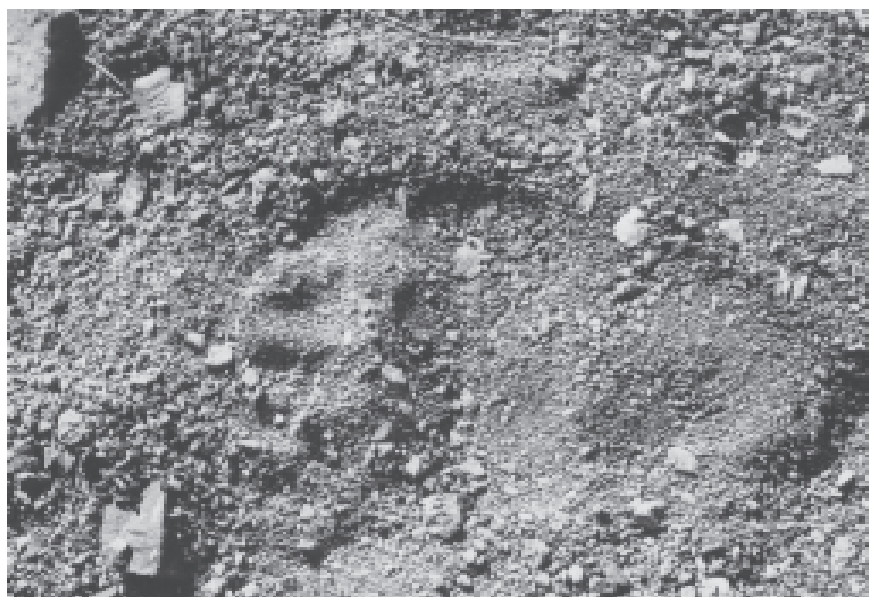
Fig. 5. Gobi Bear footprint found in Khushoot oasis area