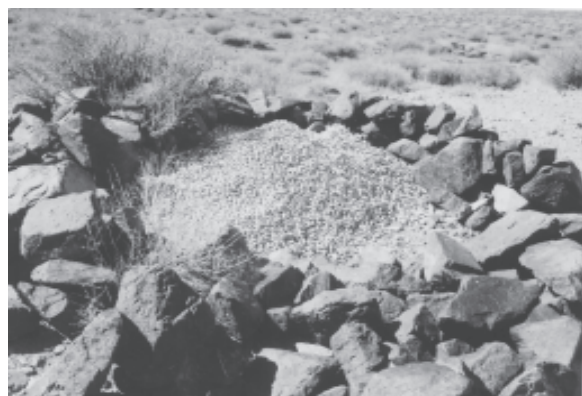
Fig. 3. Artificial feeding site

An adult male Gobi Bear in good well-fed condition was found near a food supplementation site on 29 March 2004 in Khushoot oasis area (Fig. 2). There are several sites where rangers from Great Gobi 'A' feed bears with prepared food made from vegetation (Fig. 3). The researchers took a photo (Fig. 4) and observed the individual for about 20 minutes after which they measured the footprints, the hind foot print size was 20:13cm (length:width). Length is measured from the heel to the front without the claws. Width is measured at the widest point. This individual was not seen again. The team recorded 8 footprints in five different oasis areas (Table 1).